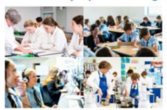
Wednesday 25 September 2024